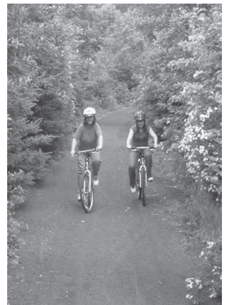
Trails are great for cyclists