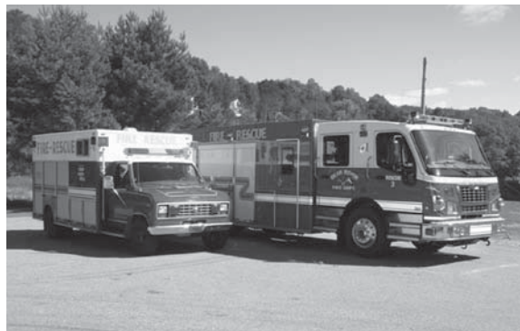
The new First Response Vehicle parked next to the old First Response Vehicle

sponsoring the 117th Cherry Carnival Festival this year which will be held on July 17 th . The department has been organizing the event since 1956 and it has been the main fundraiser for the firemen. "We also continue to put on Firemen's Breakfasts the first