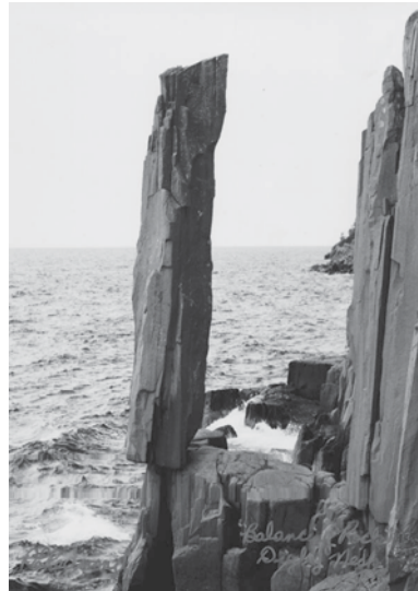
Balancing Rock Long Island

Storefront signage is also an area that the Brooks Report assesses. Many storefront signs are placed directly on the store façade and are